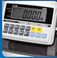
Full Featured Battery Operated Backlight LCD Indicator