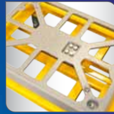
Rugged Self-Contained Cast Iron Platform