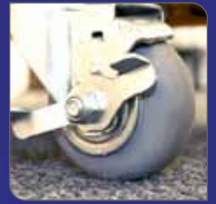
Locking Swivel Wheels