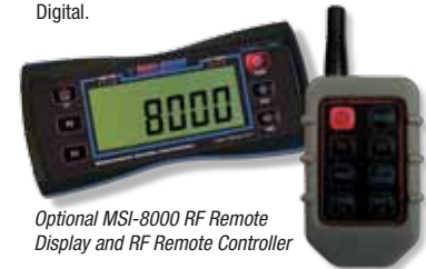
Optional MSI-8000 RF Remote Display and RF Remote Controller