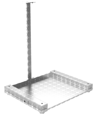
Shown with optional column